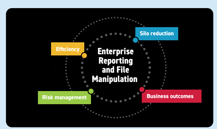
Figure 1 - Enterprise Reporting and File Manipulation

We see Broadcom as a safe bet as a company, with a rich product portfolio, which it is actively seeking to support and modernise. Its success will depend in how well it implements its mainframe product modernisation plans and, in part, on how well it manages the expectations of the customers it acquired with CA, although this seems to be settling down now after 5 years.